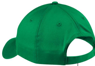
Adjustable hook and loop closure