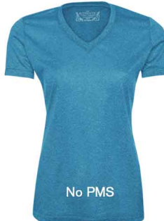
BLUE WAKE HEATHER