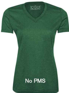
FOREST GREEN HEATHER