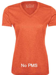
DEEP ORANGE HEATHER