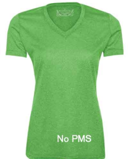
TURF GREEN HEATHER